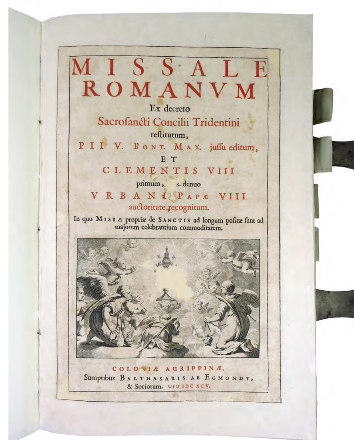
Fig. 5. After restoration