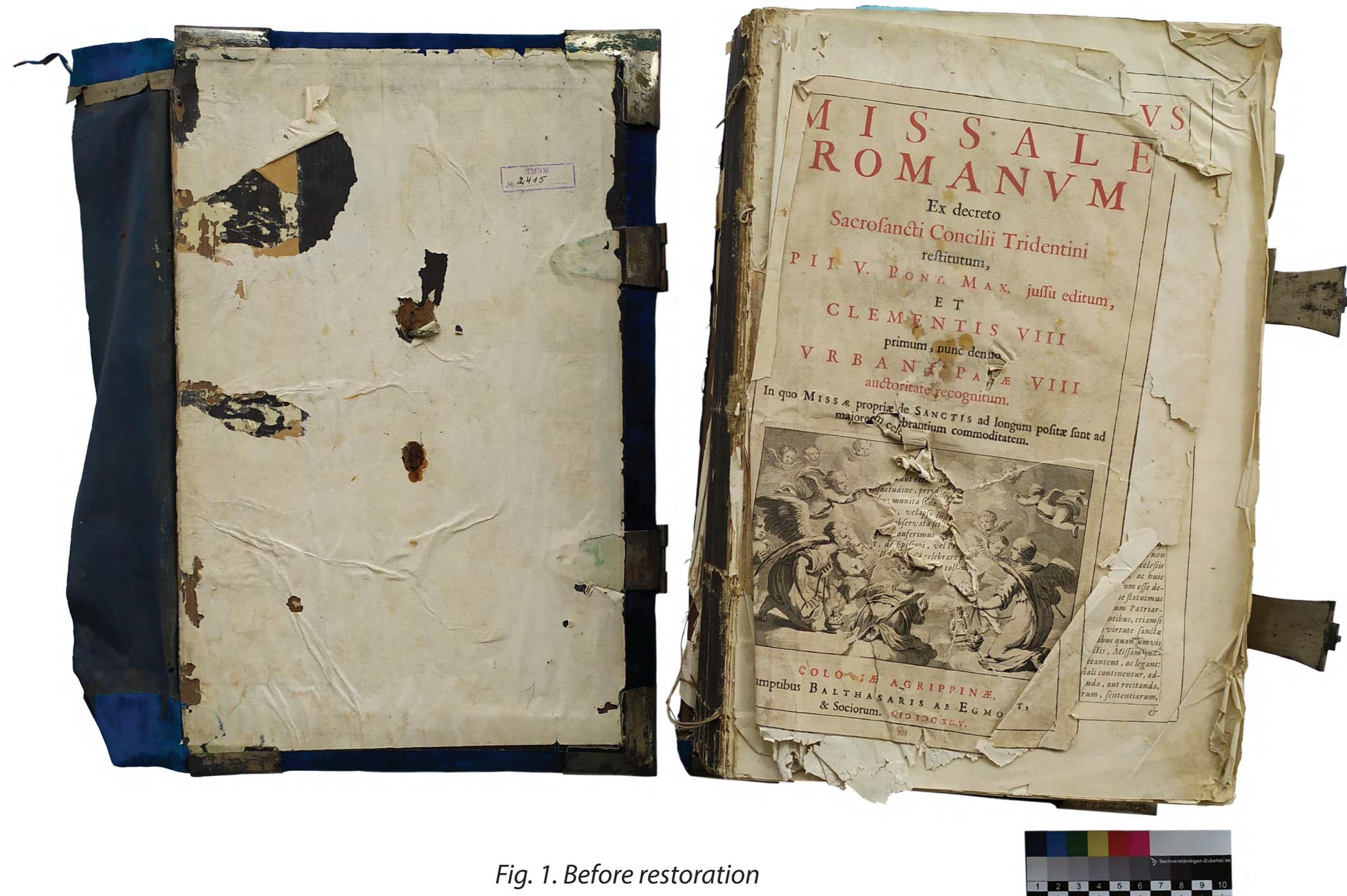
Fig. 1. Before restoration