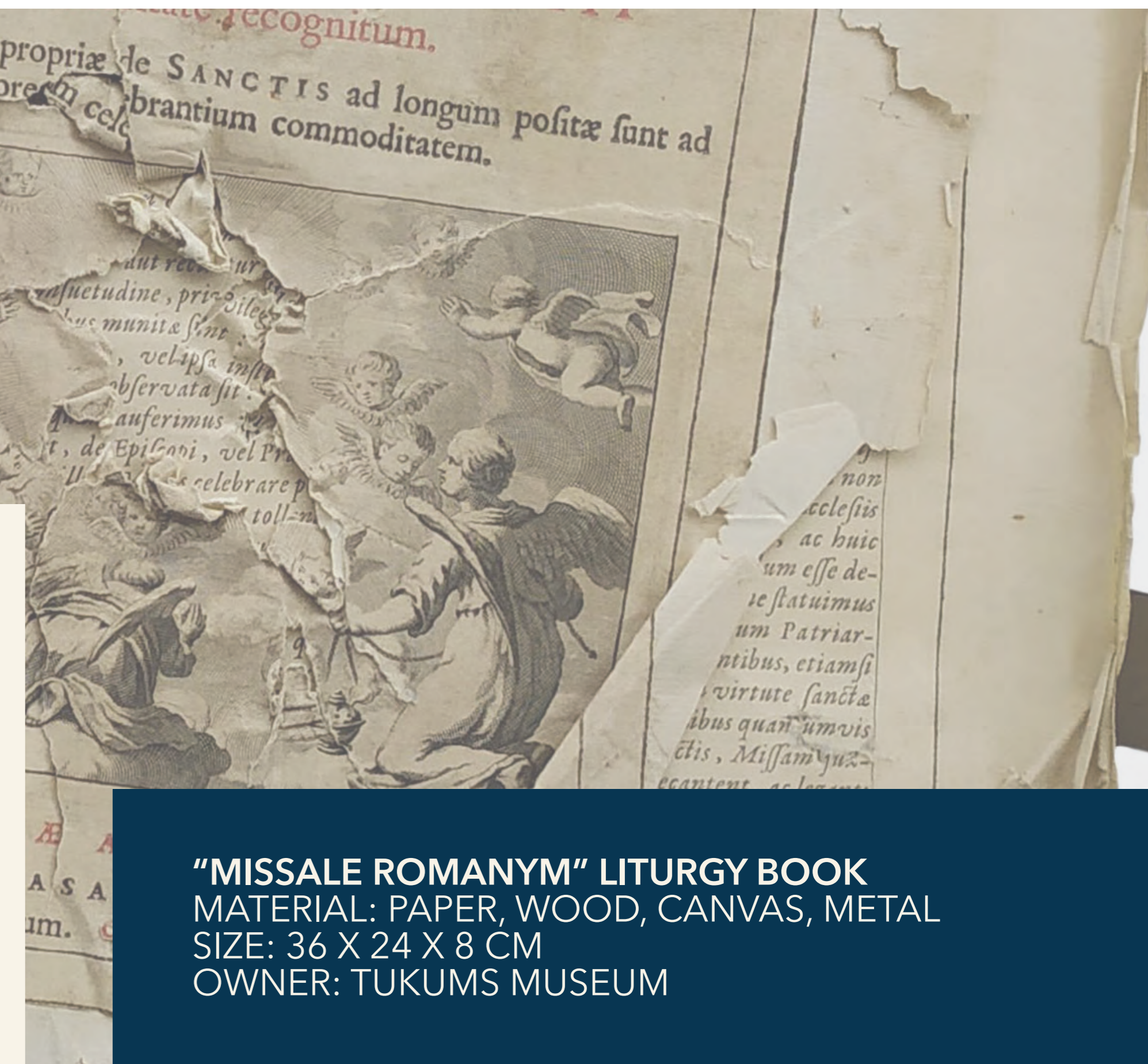
"MISSALE ROMANVM" LITURGY BOOK MATERIAL: PAPER, WOOD, CANVAS, METAL SIZE: 36 X 24 X 8 CM OWNER: TUKUMS MUSEUM

The pages have been arranged in parts and stitched with white cotton thread on three bands. The ends of the bands have come off.