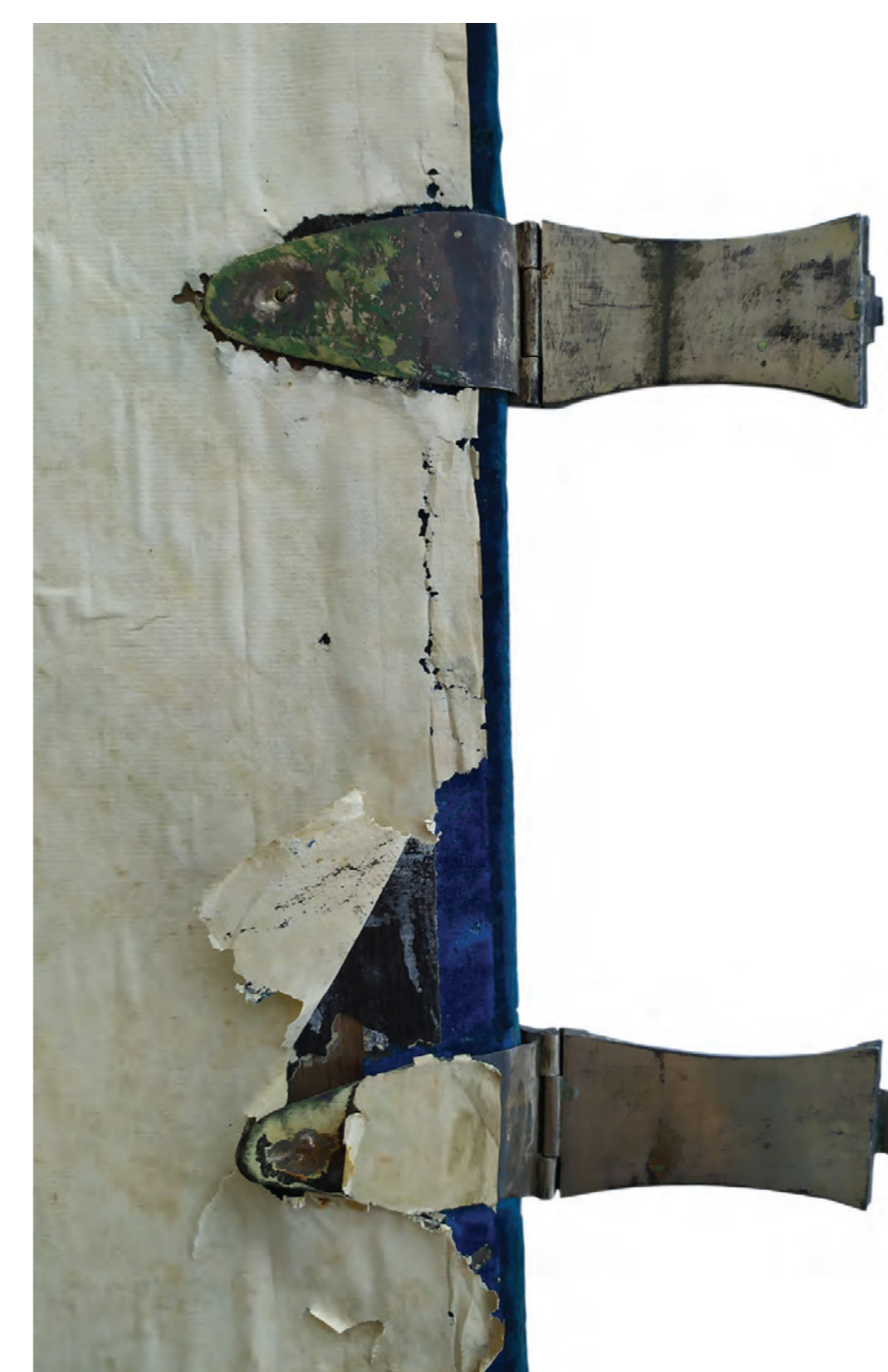
Fig. 3. Before restoration