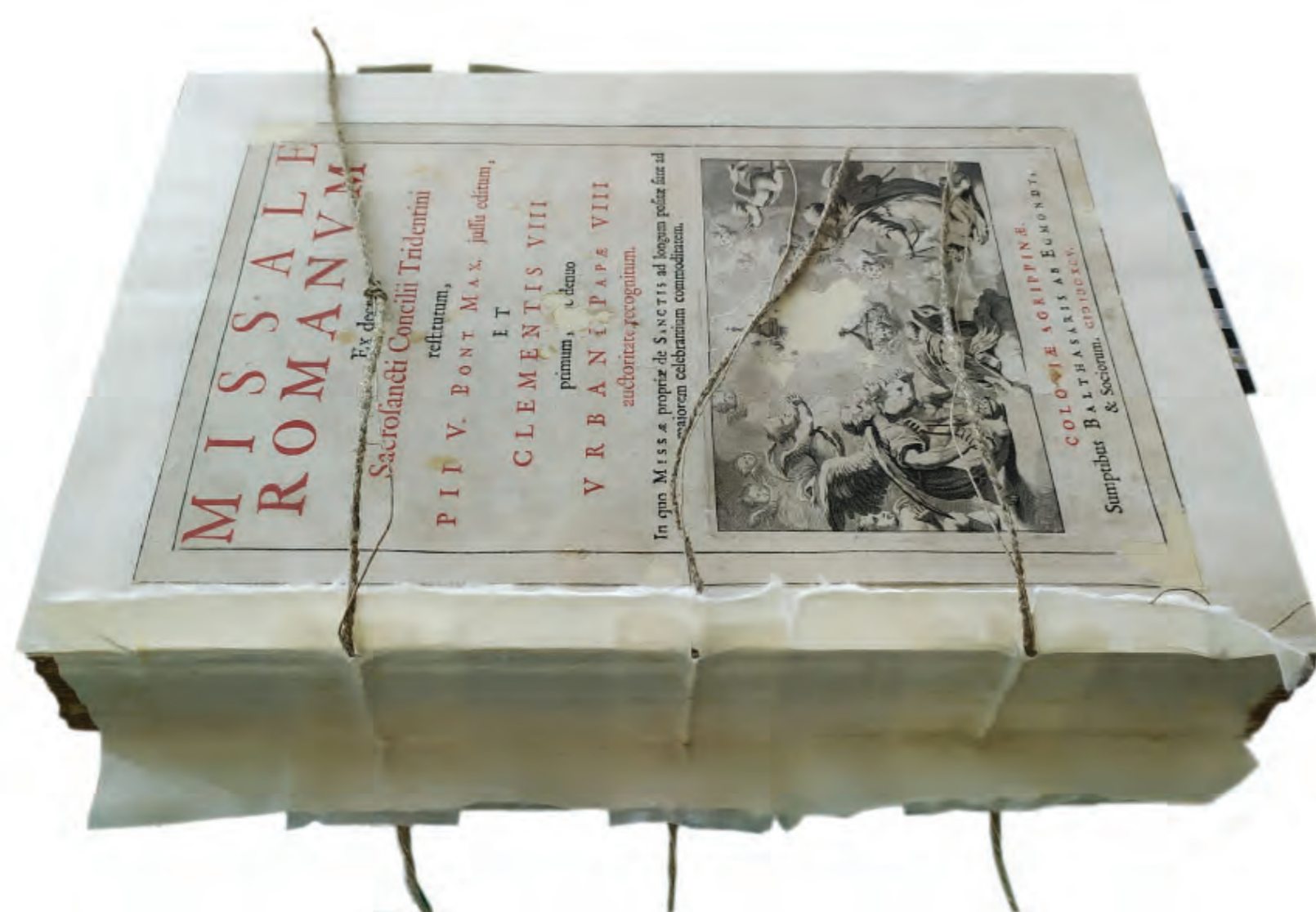
Fig. 4. Restoration process