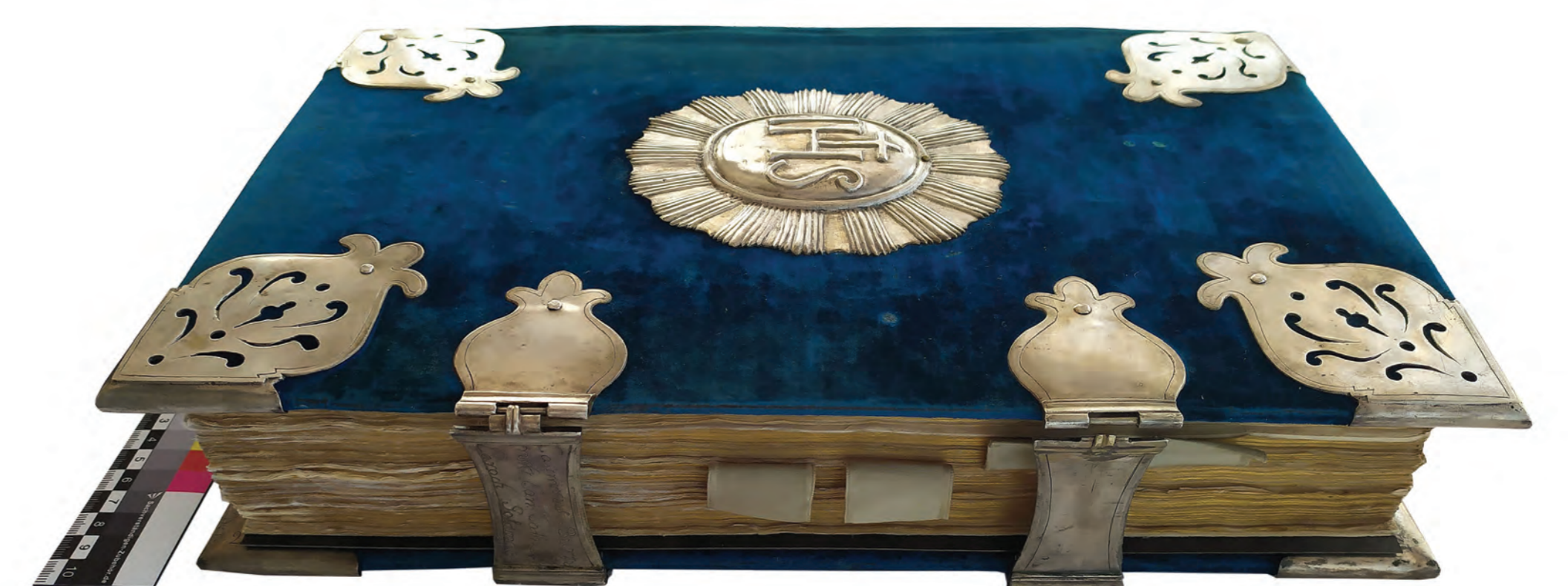
Fig. 8. After restoration