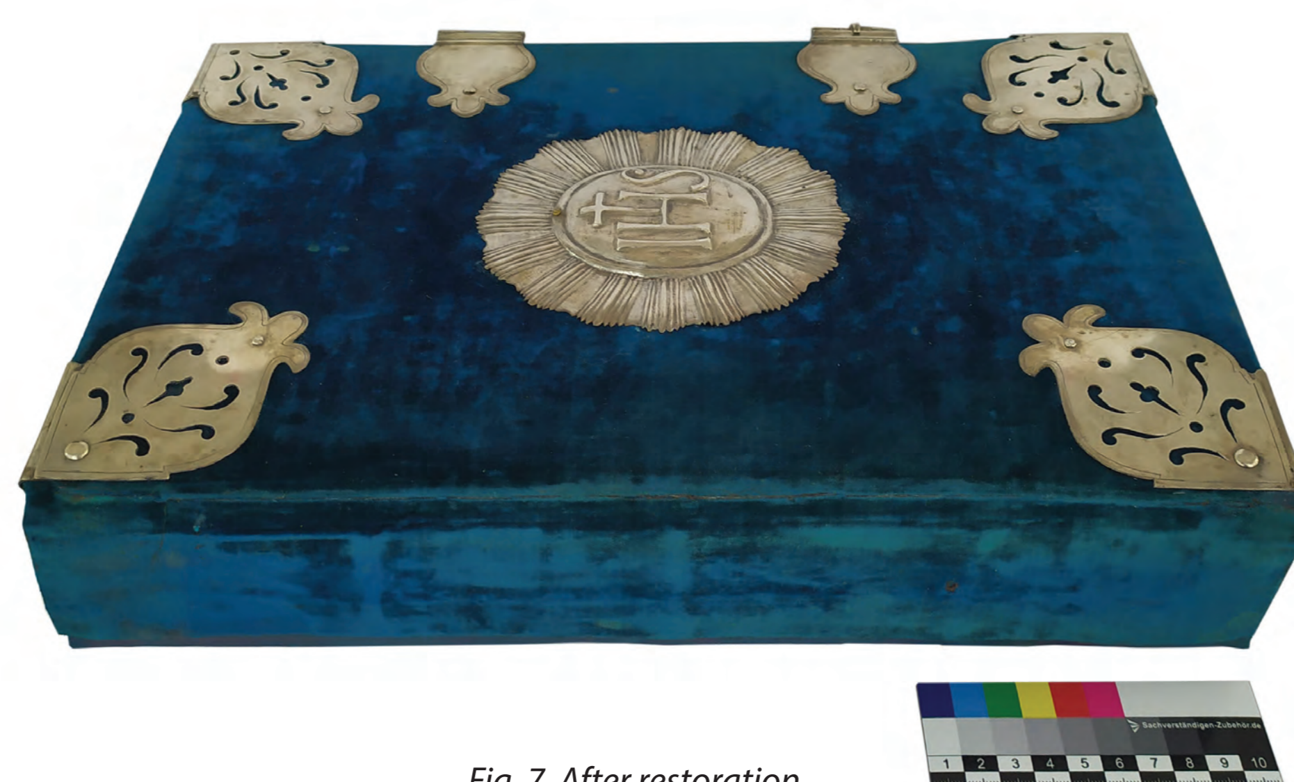
Fig. 7. After restoration