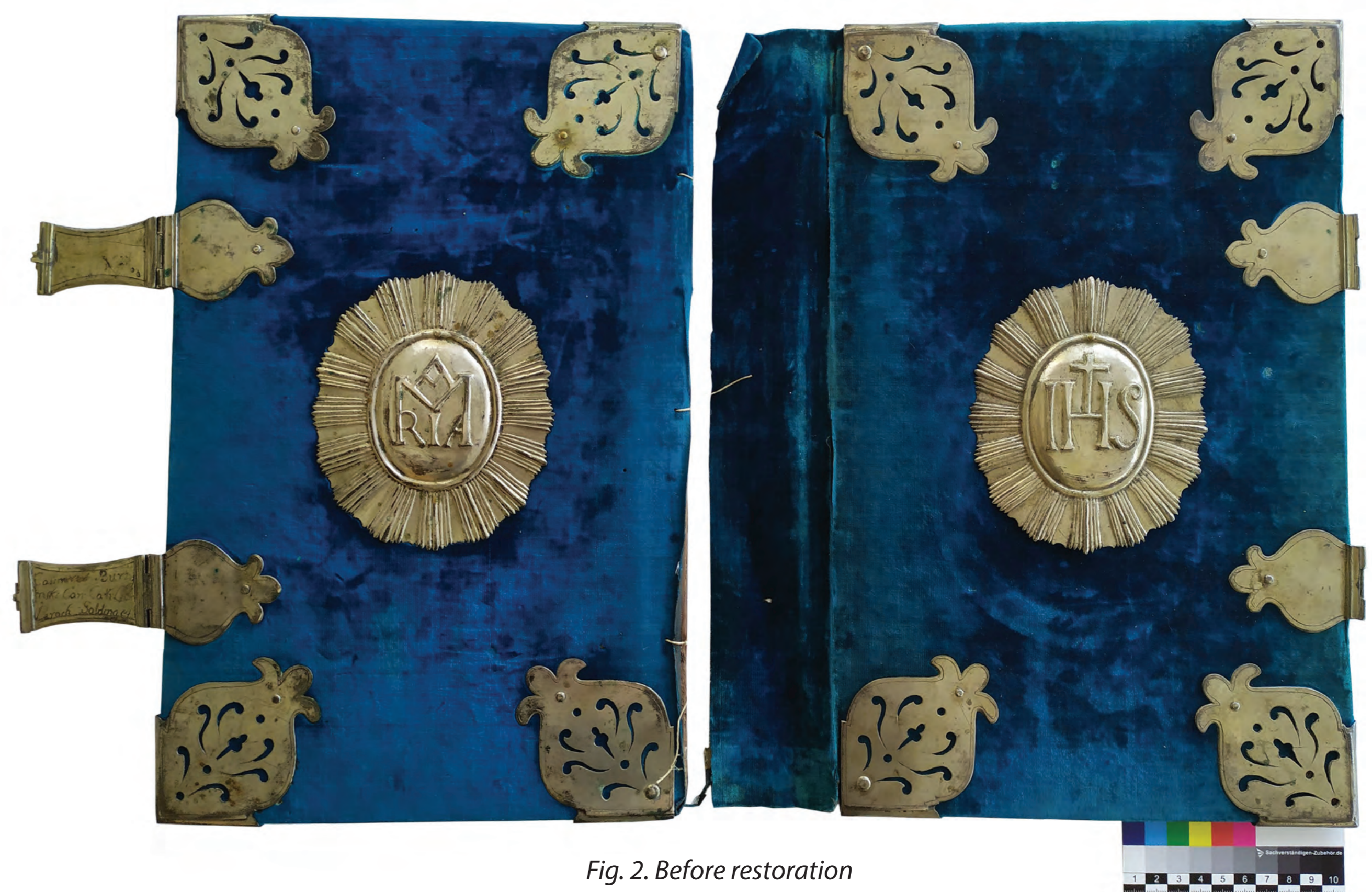
Fig. 2. Before restoration