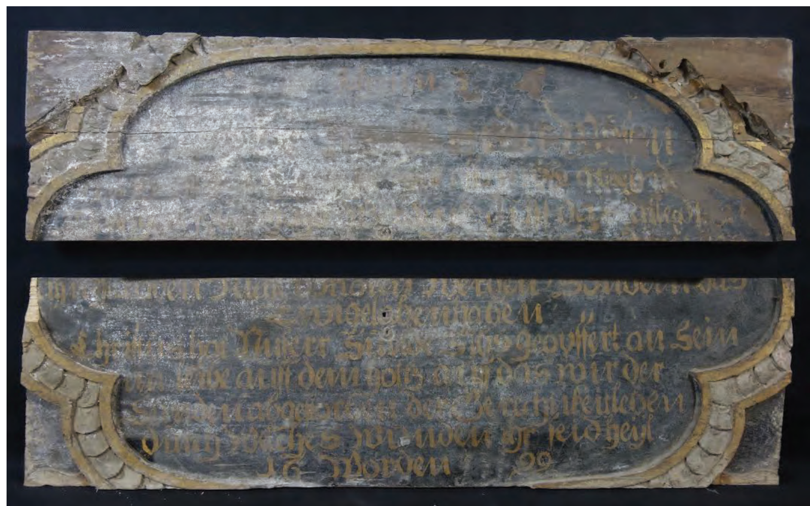
Epitaph before restoration.