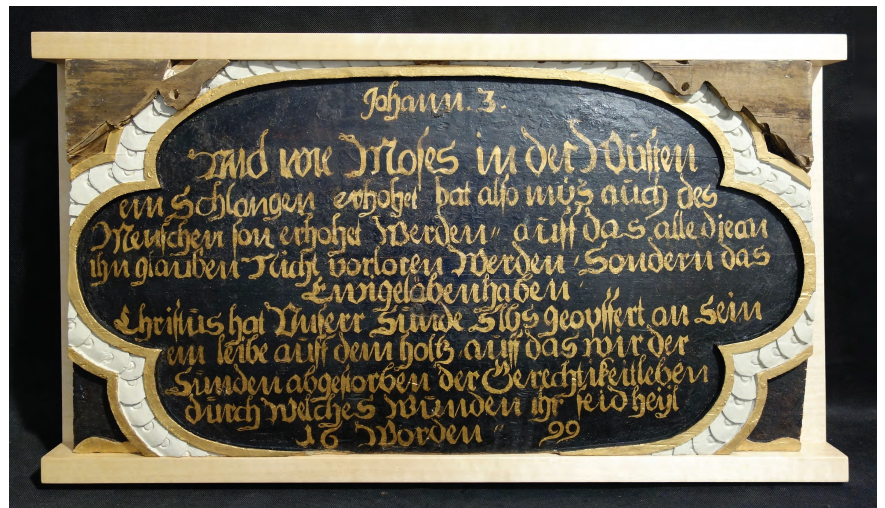
Epitaph after restoration.