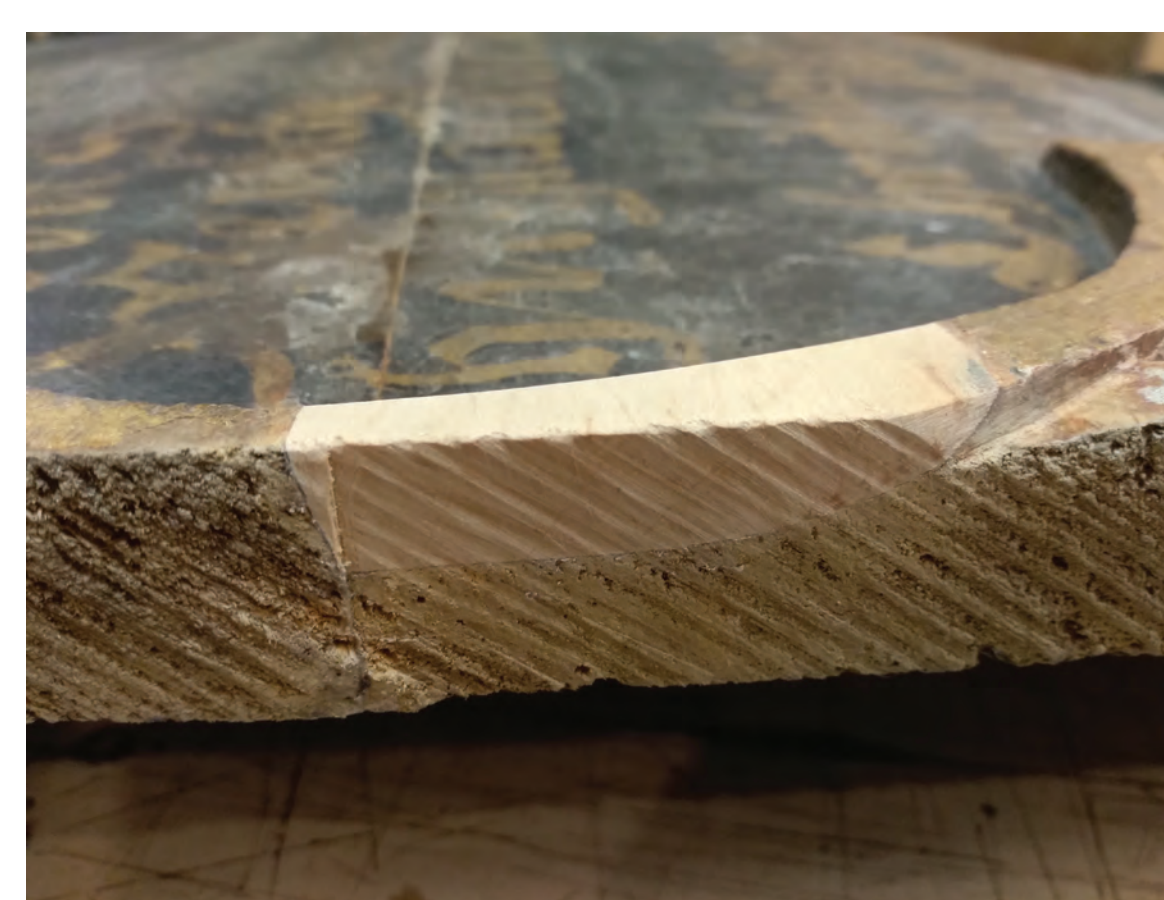
Restoration of lost wooden parts of epitaph.

Type of item: epitaph Author, maker: unknown Age: end of the 17th century Material, technique: Linden, painted Dimensions: 86 x 46 x 4 cm Owner of the item: Sesava Evangelical Lutheran Church National Heritage Register number: 3425 Time of restoration: 2017-2018