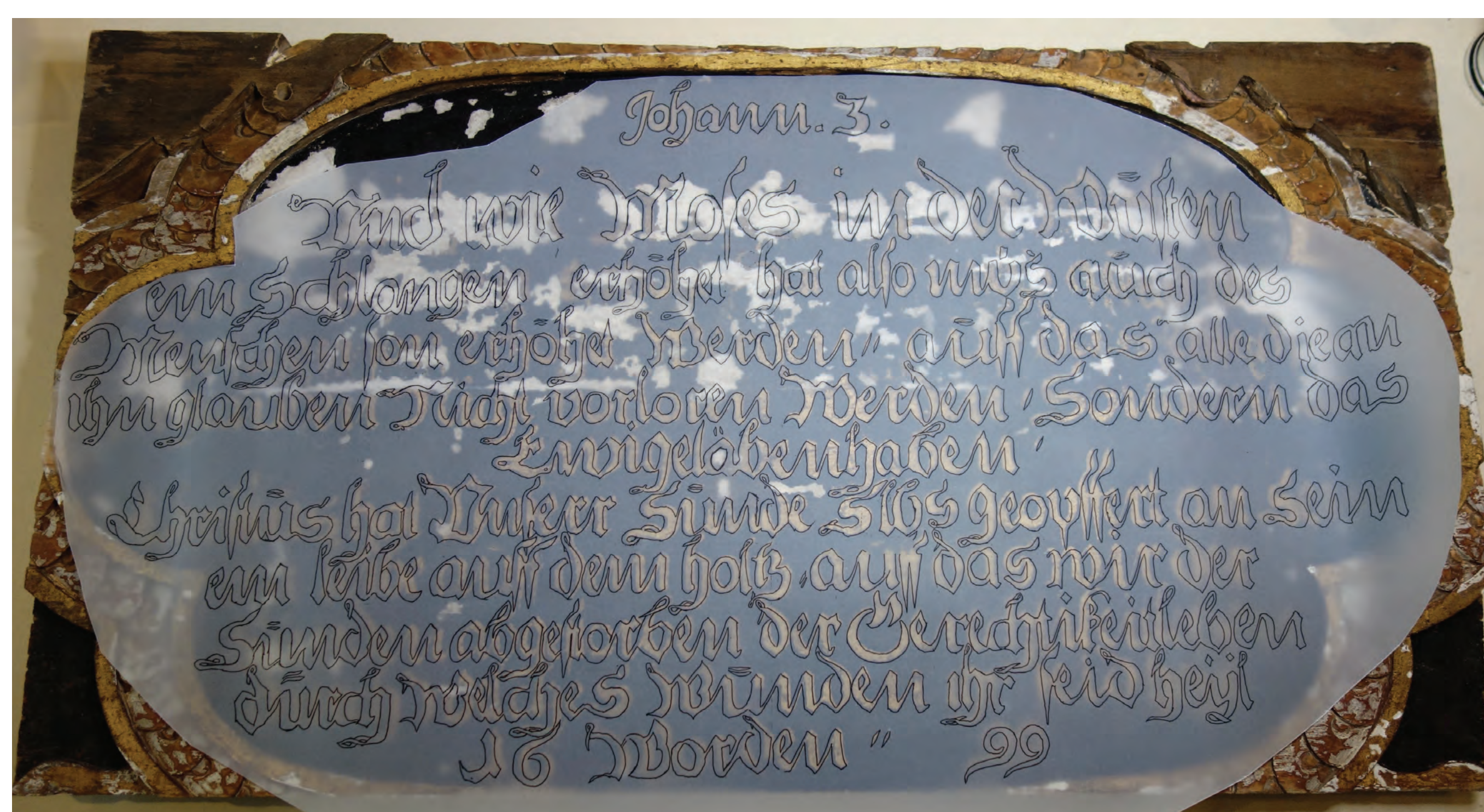
Transfer of restored letters to the epitaph surface.