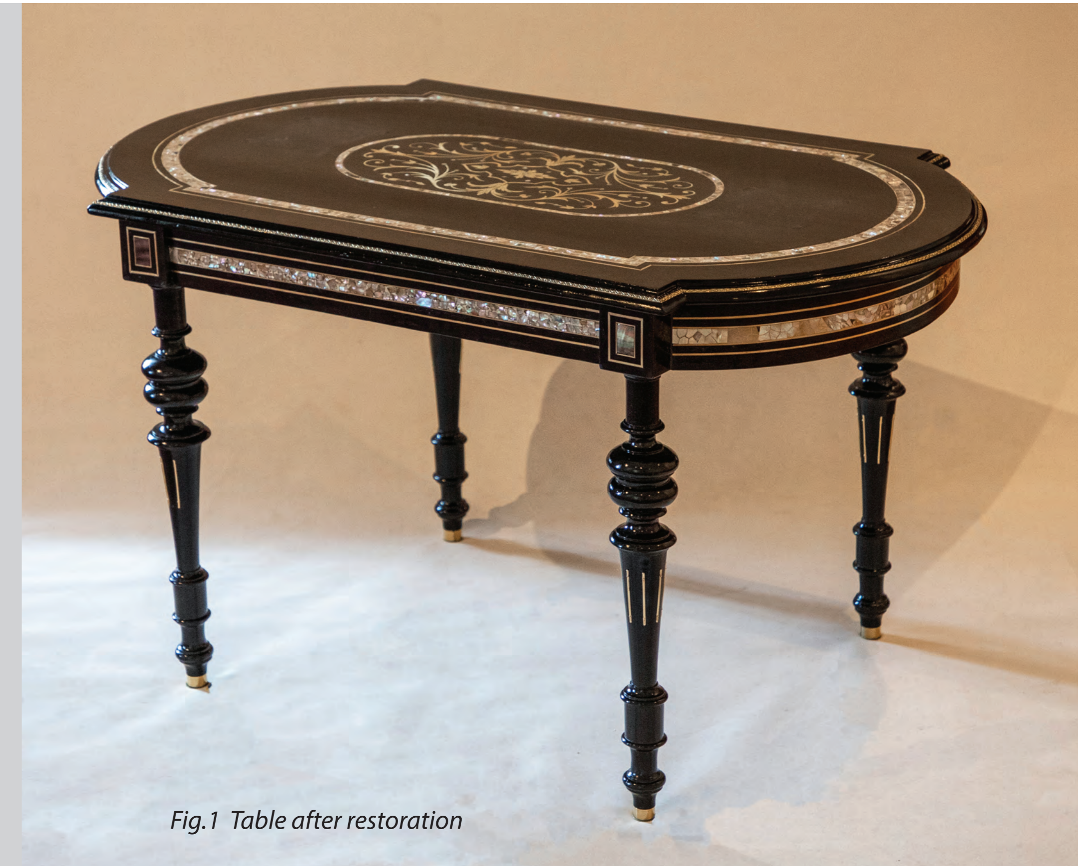
Fig.1 Table after restoration

The mechanical damage, the small losses of veneer and any cracks were filled in with black BORMA WACHS water base acrylic putty. The filled-in spots were toned with ethyl spirit stains after the application of lacquer. Small mother of pearl plates of suitable size and form were glued into the spots where there were losses in the mother of pearl incrustation; they were mechanically thinned so as to correspond to the original, prior to their gluing. The gaps between the plates were filled with putty. The missing brass ornament in the intarsia was created anew, using a fragment which had been preserved as the analogue. The ornament was transferred to the brass plate and the required form was cut out and placed in the areas where it had been lost. The decorative brass belts were cast per the original example. After the restoration of the wooden parts, the item was assembled, using a polyvinyl acetate glue (PVA) for the gluing. The item was varnished with a toned, black shellac and polished with a shellac lacquer.