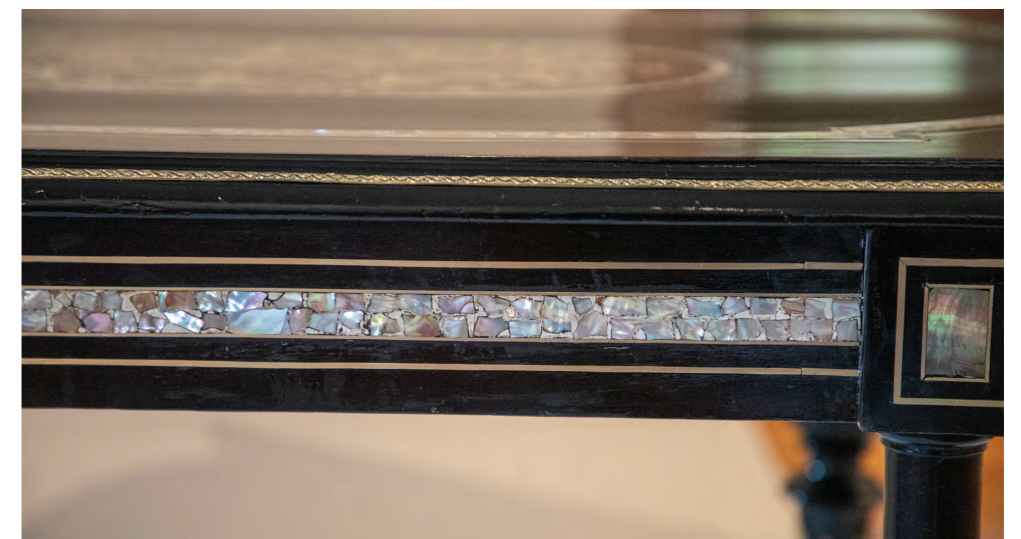
Fig.13 Fragment of the table after restoration

KEYWORDS: TABLE, INCRUSTATION, MOTHER OF PEARL, VENEER DATED: SECOND-HALF OF THE 19 TH CENTURY, RUSSIA MATERIAL: WOOD, VENEER, BRASS, MOTHER OF PEARL, STAIN, SHELLAC SIZE: 61.7 CM, 111 CM, 67.5 CM OWNER: RUNDALE PALACE MUSEUM