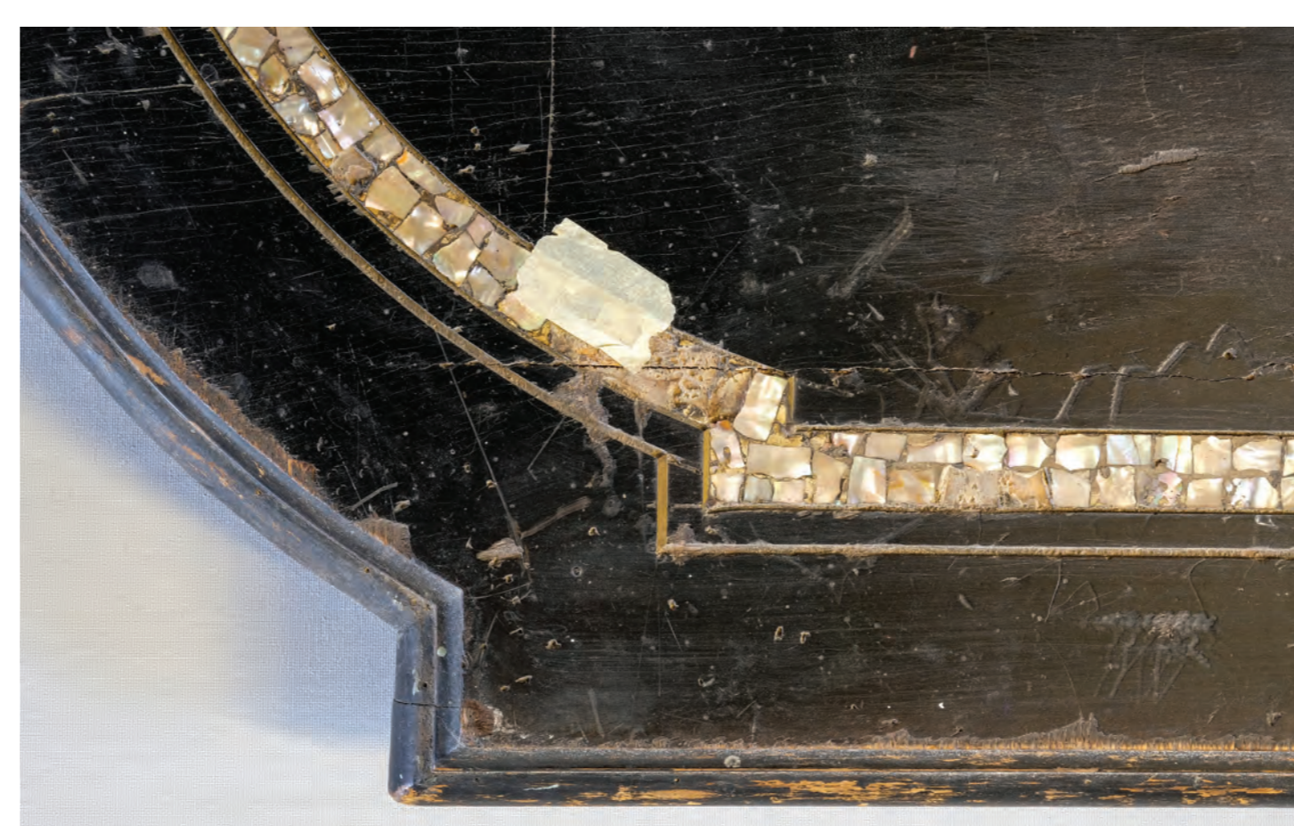
Fig.7 Fragment of the table top before restoration