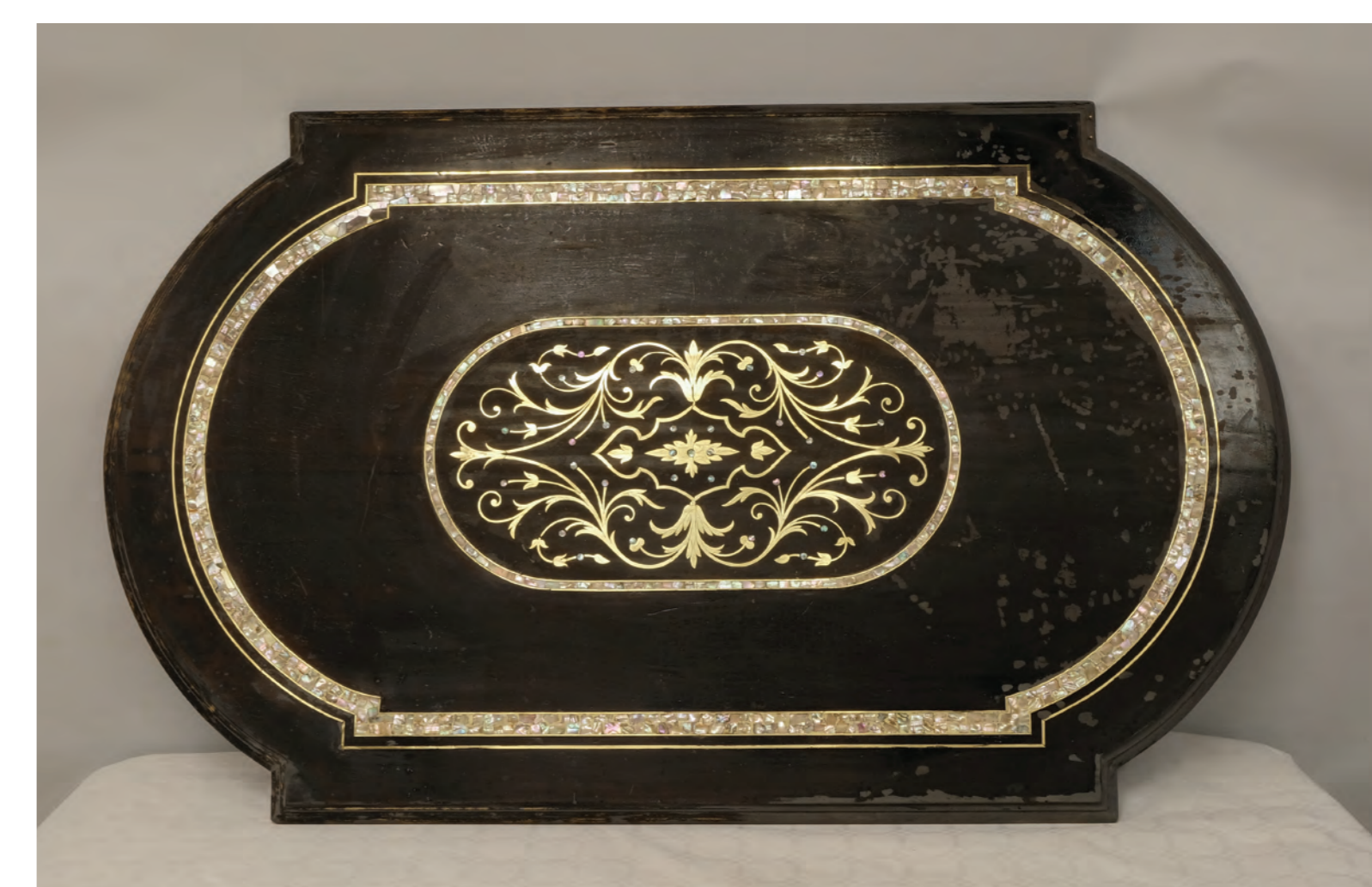
Fig.10 Table top in the process of restoration