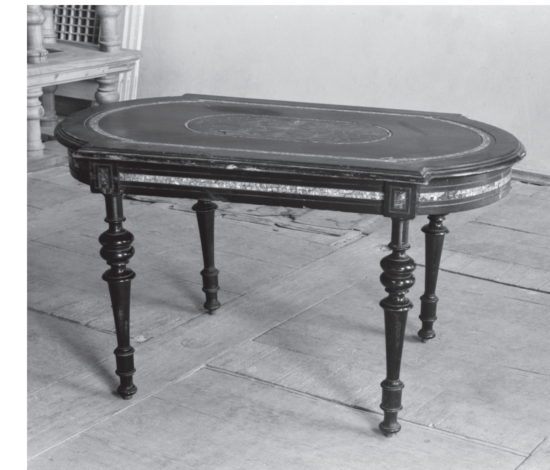
Fig.2 Table before restoration, photo from the year 1982