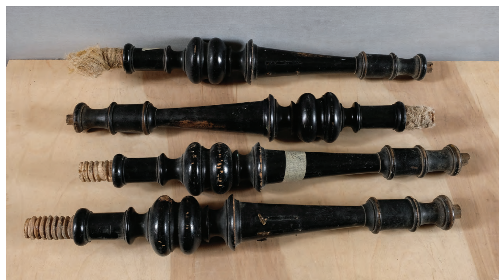
Fig.5 Table legs before restoration