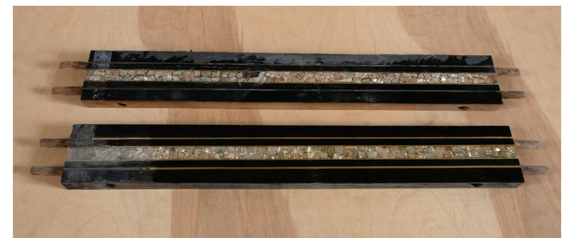
Fig.12 Table details in the process of restoration