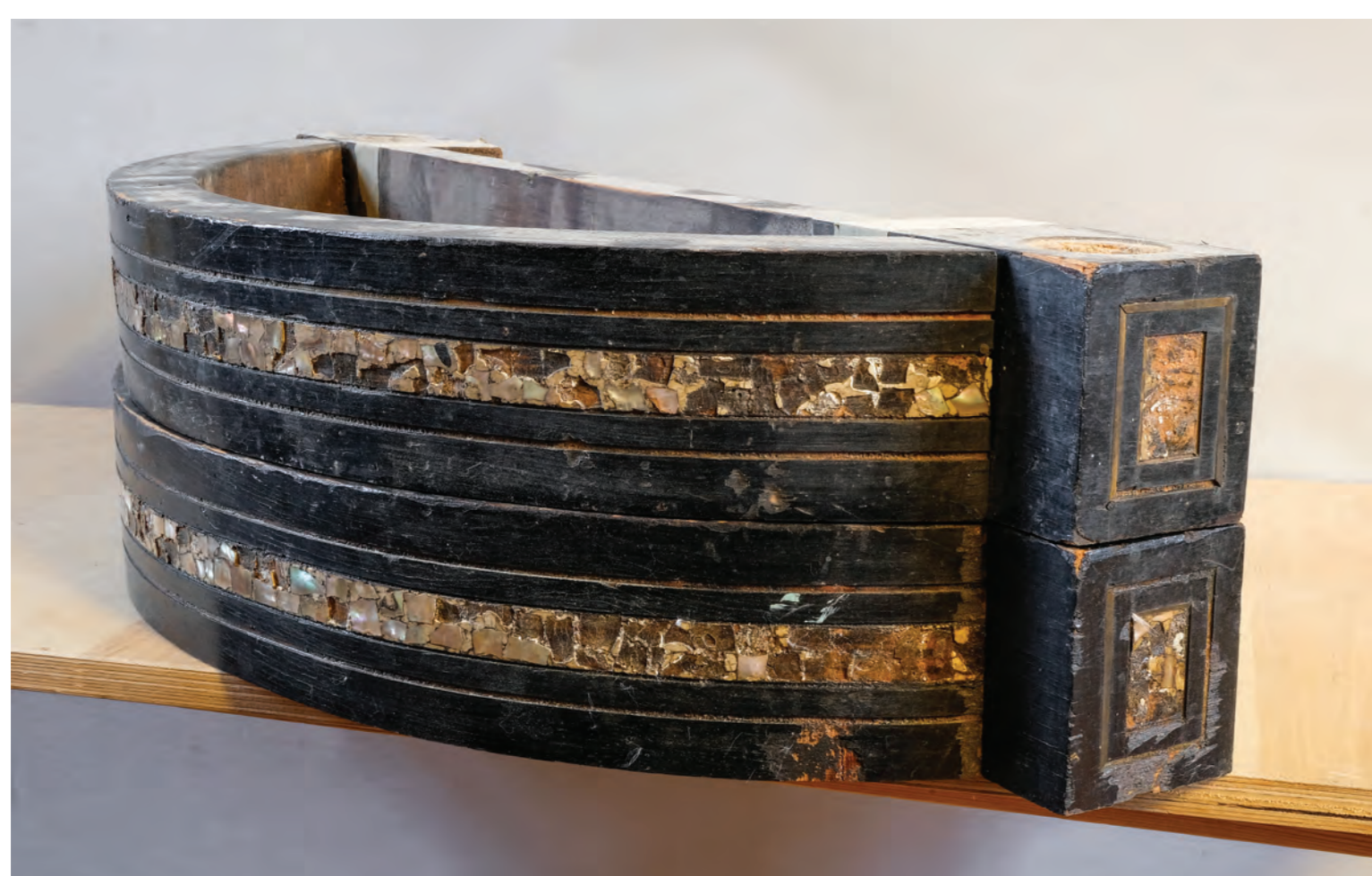
Fig.4 Details from the table before restoration