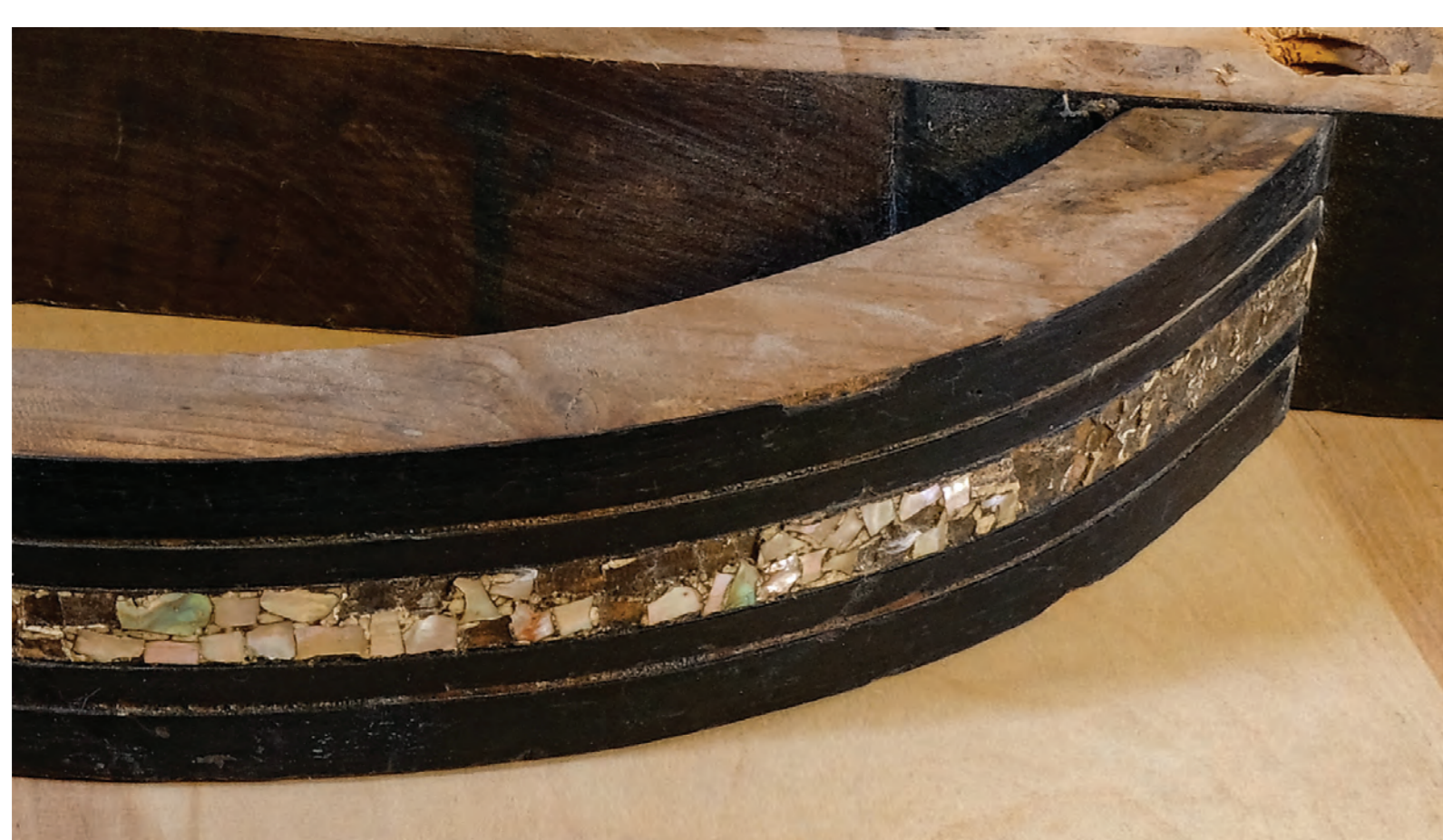
Fig.6 Fragment of the table detail before restoration