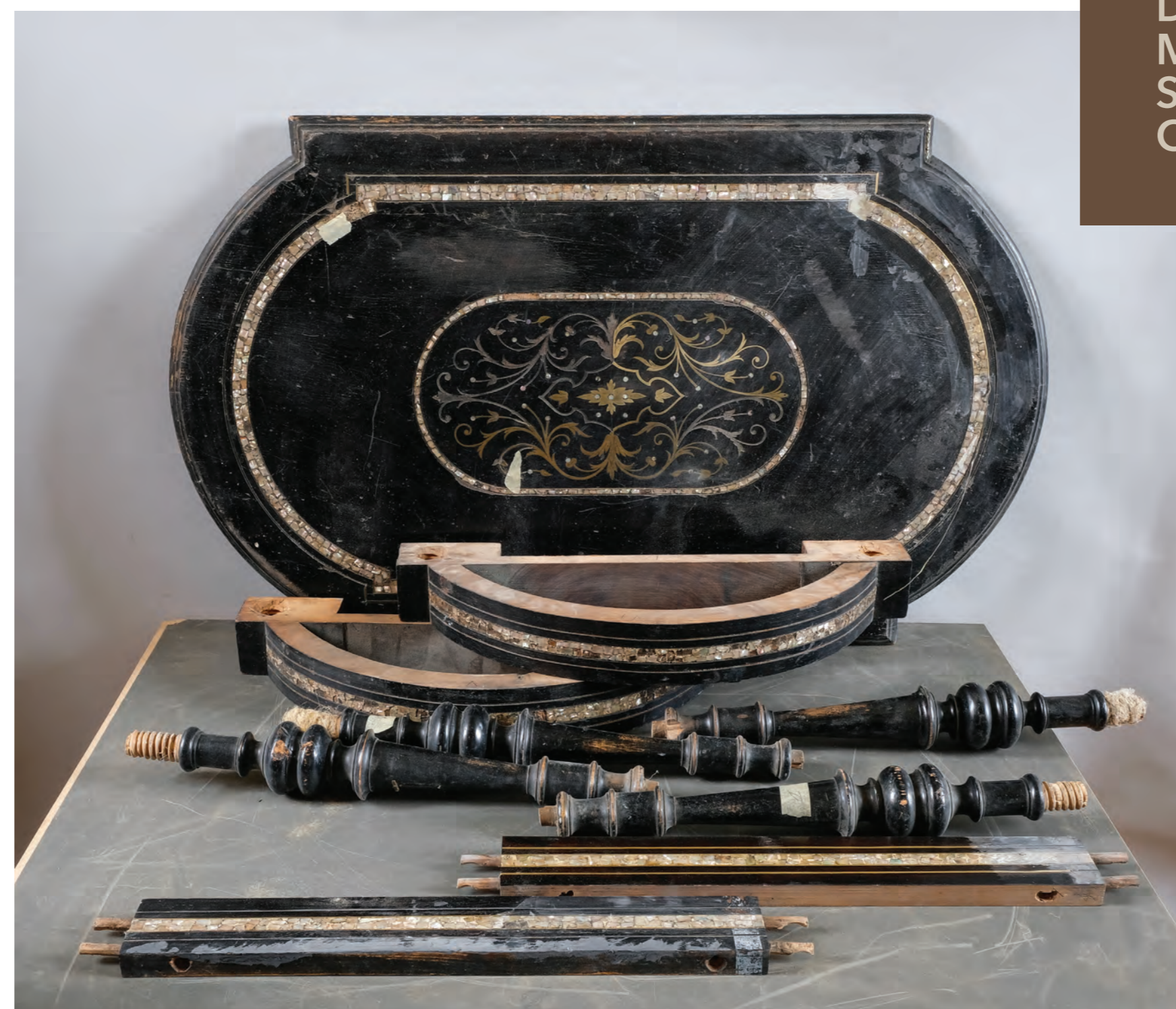
Fig.3 Process of restoration, the table is disassembled

KEYWORDS: TABLE, INCRUSTATION, MOTHER OF PEARL, VENEER DATED: SECOND-HALF OF THE 19 TH CENTURY, RUSSIA MATERIAL: WOOD, VENEER, BRASS, MOTHER OF PEARL, STAIN, SHELLAC SIZE: 61.7 CM, 111 CM, 67.5 CM OWNER: RUNDALE PALACE MUSEUM