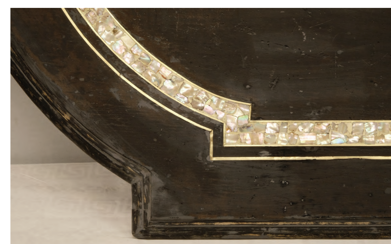
Fig.11 Fragment of the table top in the process of restoration