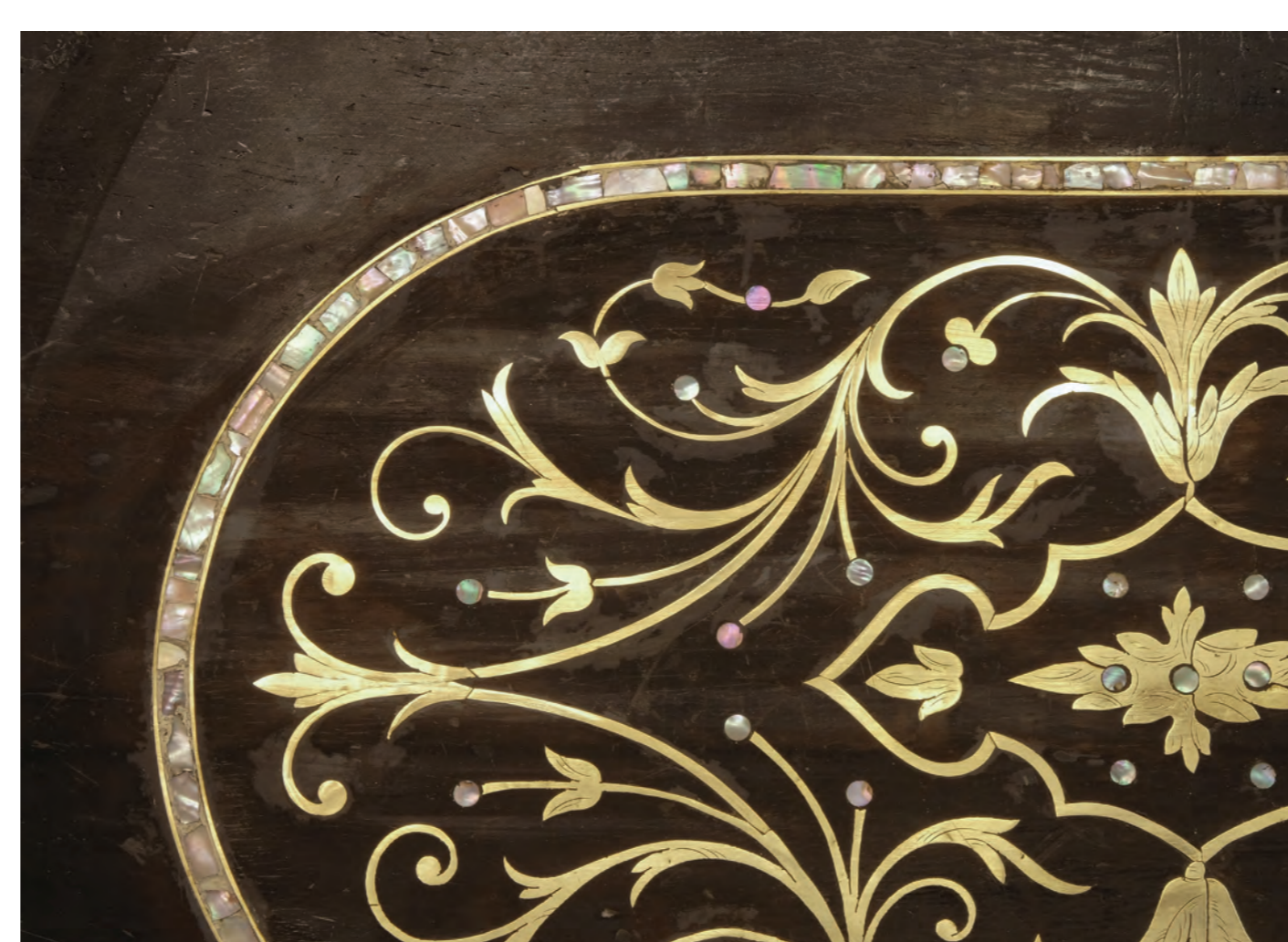
Fig.9 Fragment of the table top ornament in the process of restoration